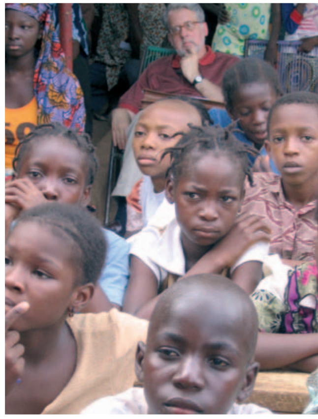
Paulo Sérgio Pinheiro in Mali Classroom

The human rights standards provide states with a clear obligation to prohibit corporal punishment. They are supported by arguments based on logic. When corporal punishment is lawful in any setting – including the home and in schools – the work of child protection is undermined because messages about the unacceptability of violence against children are contradicted by laws which condone it. No state can claim to have an effective child protection system while its laws authorise violent punishment of children.