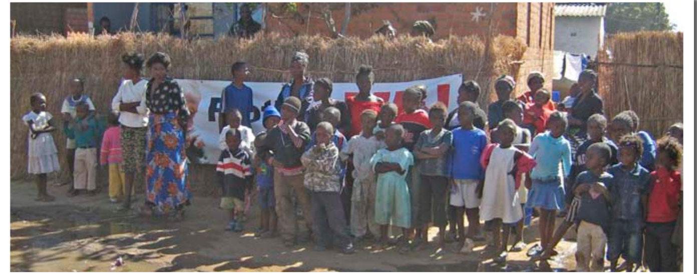
Spectators at a community march against child abuse, Zambia

Corporal punishment of children – wherever it occurs and whoever the perpetrator – breaches their fundamental rights to protection from all forms of violence and to respect for their human dignity. Its legality breaches their right to equality under the law. When it happens in schools, corporal punishment also violates children’s right to education. It is shocking that decades since the Convention on the Rights of the Child confirmed that human rights belong to children as to all other people, children continue to be assaulted in the name of “discipline” in homes, schools and other settings, and that adults responsible for educating children still attempt to justify the infliction of pain on the developing bodies and minds of those in their care. The contradictions are obvious. Hitting children teaches violence not peace, disrespect not respect, conflict not resolution. Laws which condone corporal punishment reflect the low status of children in society, not a commitment to their equal status as human beings symbolised by almost every states’ ratification of the Convention on the Rights of the Child.