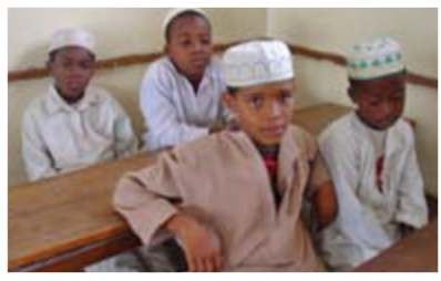
Children in Zanzibar

The overall aim is to stop corporal punishment being inflicted on children, in schools and wherever else they may be. Achieving prohibition in schools will have a greater impact (and be easier to enforce) when prohibition is also being promoted in the home, giving a clear and consistent message to all adults that hitting children is wrong.